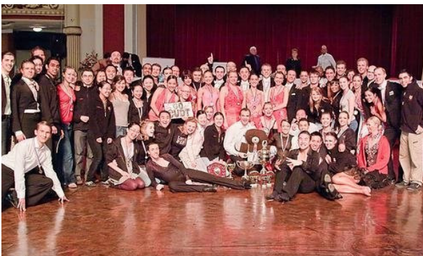
The successful dancesport team at IVDC 2009 in Blackpool